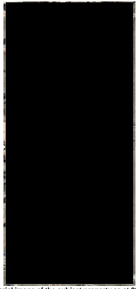
Figure 2: Aerial image of the subject property as at 22 January 2020

The subject property is cleared of vegetation with the exception of an area of shrubs and trees towards the southern portion of the site. This vegetated area does not form a connection with vegetation on adjoining properties, and is bisected by an unsealed vehicular track. An aerial photograph of the subject property is below at Figure 2.