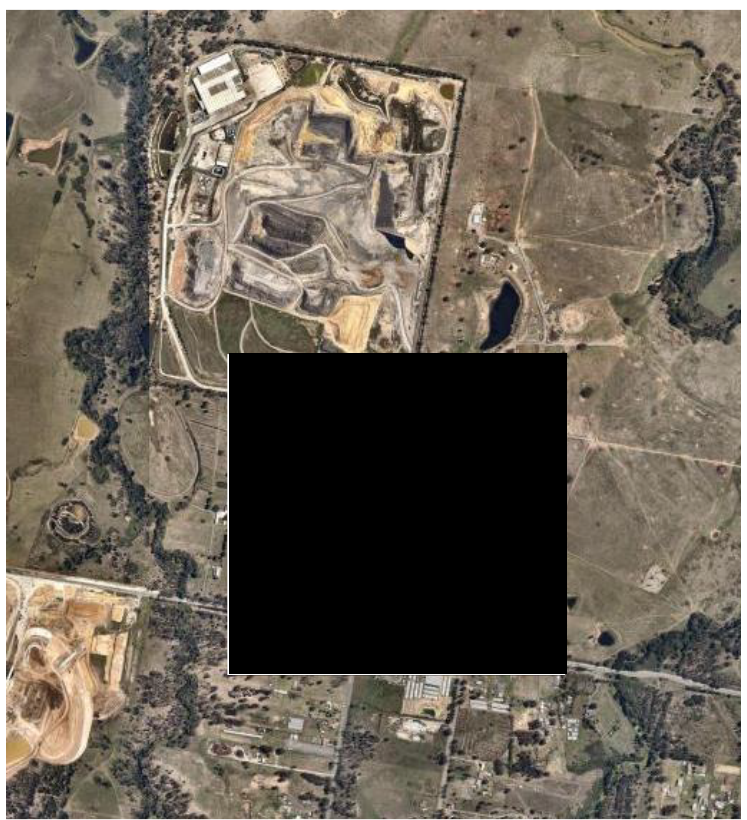
Figure 4: Aerial image of site and surrounds as at 22 January 2020