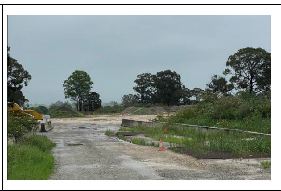
Figure 3: Photographs taken on 14 February 2020

Photo 4: Image taken unnamed road (north)